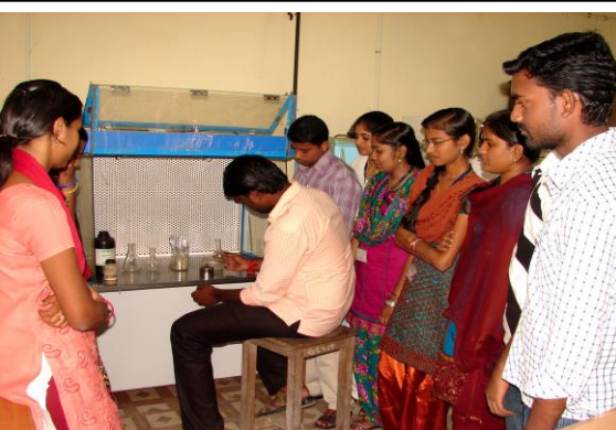
Plant Science Lab.